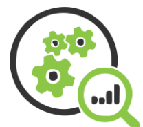
Small Works Project